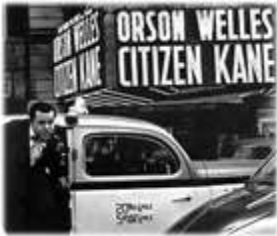
(Click to Play)

For Exhibitors About Films, the Film Industry and Cinema Advertising