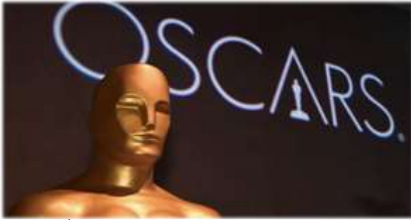
The 93 rd Academy Awards will be held in Los Angeles on February 28, 2021

See also: The Movie Theater Industry Can't Afford the Fight AMC Just Picked (The Motley Fool)