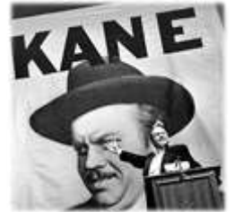
(Click to Play)

On May 1, 1941, RKO Radio Pictures held the premiere of Citizen Kane at New York's Palace Theatre, considered by many film historians to be the best movie Hollywood has ever produced . It was the film debut for Orson Welles, who produced, co-wrote, directed and starred in the story of Charles Foster Kane, a supremely successful and ruthless newspaper tycoon. It was widely reported that Welles based Kane's heartless character on his perception of the real-life publisher William Randolph Hearst, prompting much controversy. In addition to Welles' central role, the contributions of cinematographer Greg Toland and editor Robert Wise are also considered essential in creating the masterpiece.