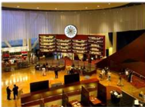
The Arclight Hollywood